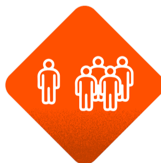
Neglect by others