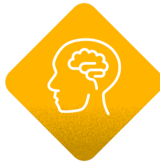
Emotional or psychological