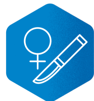
Female Genital Mutilation (FGM)